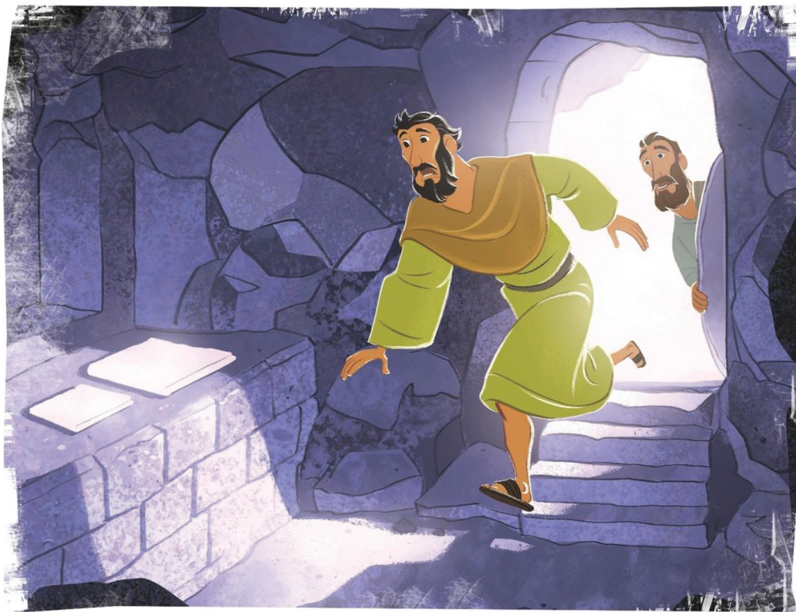
Jesus' Resurrection (Matthew 28:1-15; John 20:1-18) • Unit 26, Session 2 •

So Peter and the other disciple started for the tomb. Both were running, but the other disciple outran Peter and reached the tomb first. He bent over and looked in at the strips of linen lying there but did not go in. Then Simon Peter came along behind him and went straight into the tomb. He saw the strips of linen lying there, as well as the cloth that had been wrapped around Jesus' head. The cloth was still lying in its place, separate from the linen.